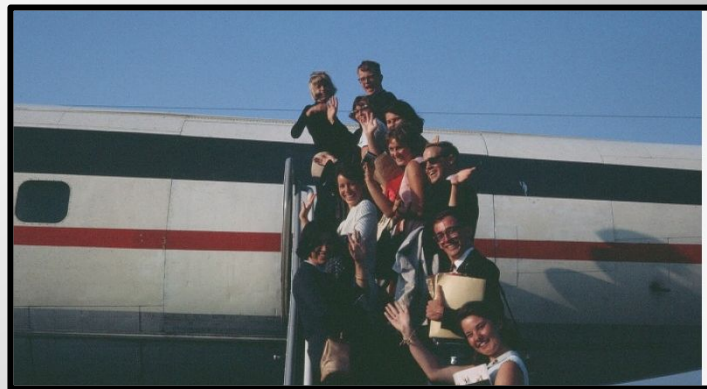
First EIL to Ireland in 1964