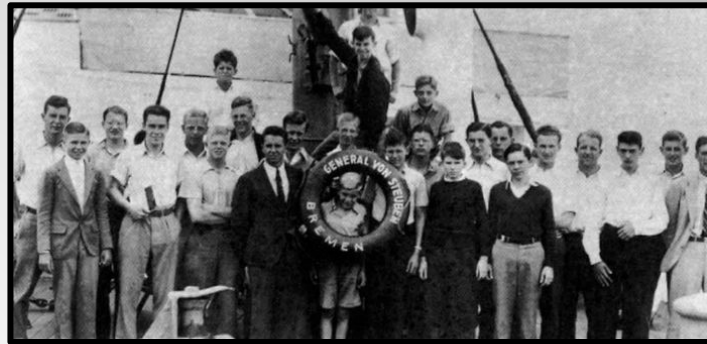
First EIL group to Europe in 1932 after WW1